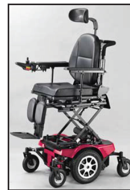
Seat elevator travel range: 30cm/12inch