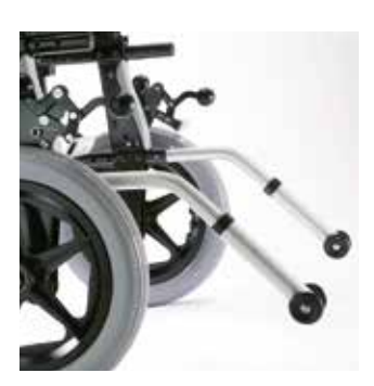
Anti-tippers Provide extra safety slopes or uneven ground.