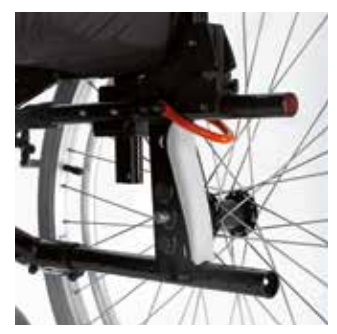
Adjustable center of gravity The rear wheel plate can be adjusted by 50 mm in depth and propose 3 positions in height.