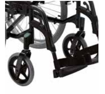
Castor housing The castor housing is mounted outside to have more space for the feet when transfering of foot propelling.

The tried-and-tested technology of the Action family products allow individuals to go wherever they desire. Cross-compatibility between a number of components on the Action³<sub>NG</sub>, Action⁴<sub>NG</sub> and Action⁵ make this an ideal, basic, fleet product that can be easily adapted to meet individual needs. Also available in a transit version.