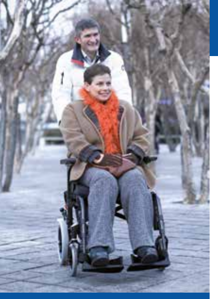
Features and Options