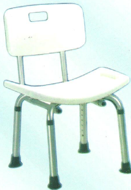
Bath Bench With Back Shown

If you have a question about your product or this warranty, please contact an authorized dealer.