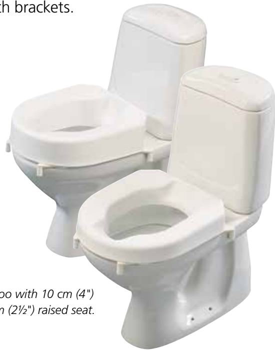
Etac Hi-Loo with 10 cm (4") and 6 cm (2½") raised seat.

Hi-Loo with brackets is a raised toilet seat which is extremely stable and yet easy to remove. The seat is ergonomically shaped and the recesses at the back and front provide for convenient intimate hygiene. Hi-Loo is available both with and without lid and in two different heights.